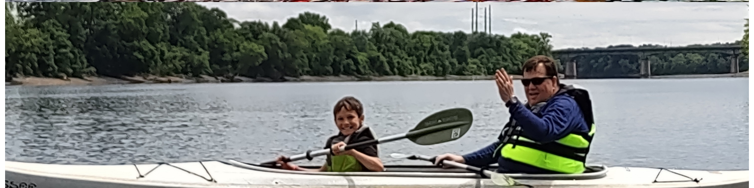
Kayaking on the Connecticut river with some of our church youth. The weather cleared up and it was a beautiful afternoon to go kayaking.